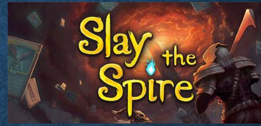
Slay the Spire by Mega Crit Release date: 11/15/2017

Currently the plan is to release as Early-Access with defined Targets or Full Release.