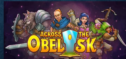
Across the Obelisk by Dreamside Release date: 04/08/2021

Strong Overlaps(cards, teams and Online Coop) , Cardtographer USPs are 3D Graphics and much lower entry price (AtO has many builds locked in paid DLCs)